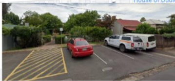
38 Main St Car Park & Entrance