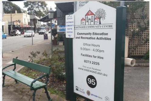
95 Glen Osmond Rd Entrance & Carpark